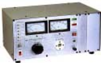
500A (AC Only)