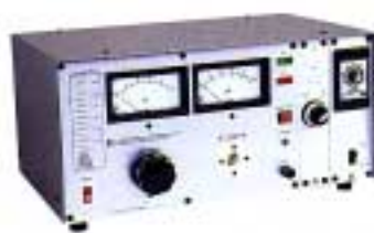
500ADT (AC, DC & Timer)