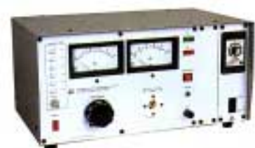
500AT (AC & Timer)