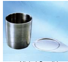
Nickel Crucible 镍坩埚 11-292-008 Capacity: 500ml