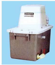
Water Aspirator Vacuum Pump 水压式真空泵 33-591-001

11-245-002 11-245-003 Model SR-2 Model SR-3 8 x 200-300ml 6 x 500-1000ml separatory funnel, separatory funnel,