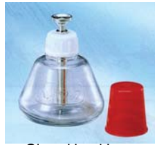
Glass Hand Lap 玻璃溶剂分配瓶 11-071-001 Capacity: 225ml

12-261-002 12-261-003 2ml Red Color 3ml Red Color