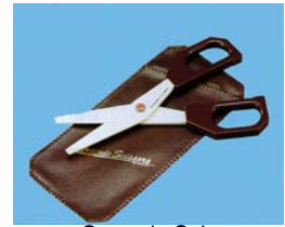
Ceramic Scissor 陶瓷剪刀 11-147-001 Model C-170 Length: 170mm