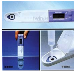
pH Meter 微型样办酸碱度测定仪 24-001-402