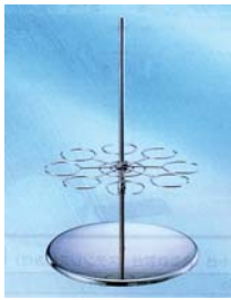
Separatory Funnel Support 不锈钢漏斗支架

11-245-002 11-245-003 Model SR-2 Model SR-3 8 x 200-300ml 6 x 500-1000ml separatory funnel, separatory funnel,