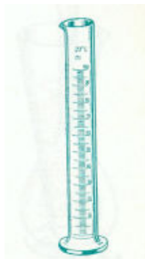
GW-5 to GW-12