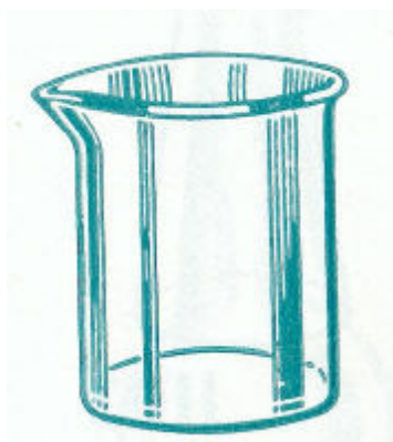
GW-13 to GW-21

Glass Beaker , low form, with spout, borosilicate glass, with printed graduations for 50 - 1000 ml.