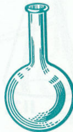
GW-30 to GW-33