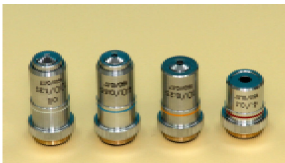
HKS-SP-33A to HKS-SP-33D

Achromatic Objectives. The objectives below are standard size, coated achromats. They will fit most standard microscopes.