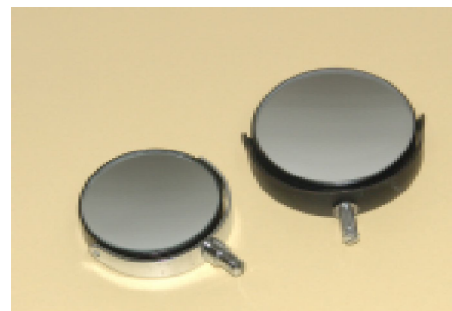
HKS-SP-34A to HKS-SP-34B

HKS-SP-34B, 50mm diameter. (for standard microscopes)