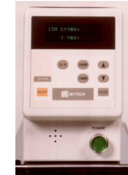
Computer type meter detector With English control panel