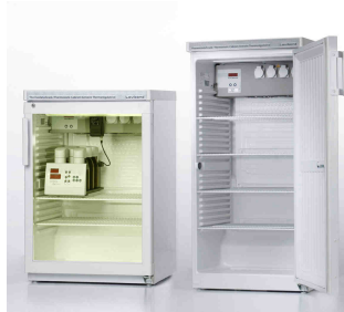
Models with glass door is available