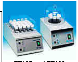
ET125 and ET108