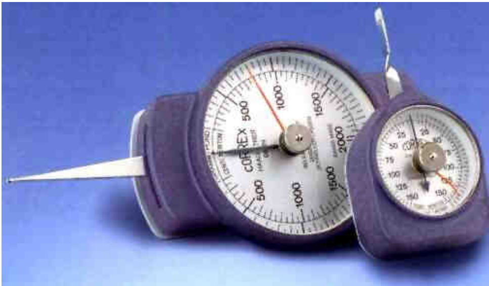
Large size (KM)