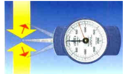
How to use

An ideal instrument for measuring small mechanical forces. Typical applications are testing and checking of: controls with adjustable frictional torque, spring tension in micro switches and all types of relay contacts and the contacts etc. in motor vehicles