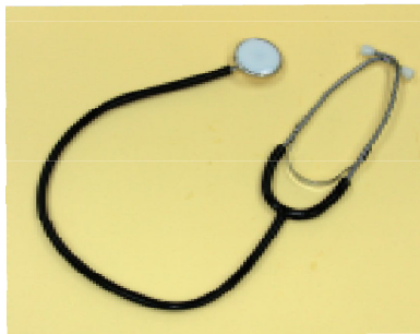
PA-SS-1 & PA-SS-2

Stethoscope , this sensitive stethoscope has a 4cm chestpiece with a raised stem, 56cm PVC Y-tube, and adjustable chrome-plated brass binaurals, white ear tips.